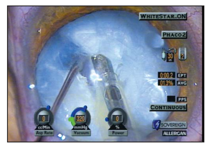
Fig. 1: Horizontal chop divides nucleus in a mature white cataract. Note trypan blue stained anterior capsule, and high vacuum purchase of the nucleus.

These universal benefits of both horizontal and vertical phaco chop are particularly important for complicated cases – those with brunescent nuclei, white cataracts, weak zonules, capsulorhexis tears, and small pupils<sup>2</sup> [Figure 1].