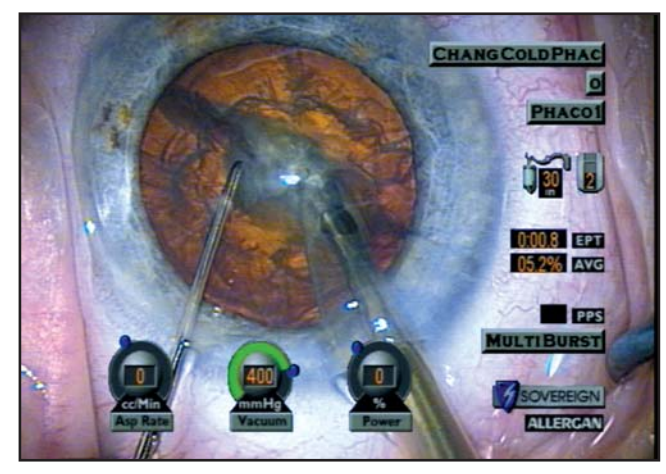
Fig. 4: Vertical chopper incises in front of the centrally impaled phaco tip (burst mode, high vacuum) to create the cleaving fracture.

As an initial step, the central anterior epinucleus should be aspirated with the phaco tip. This helps the surgeon to better estimate the size of the endonucleus, and the amount of separation between the endonucleus and the capsular bag. The chopper tip touches the central endonucleus, and maintains contact as it is passed peripherally beneath the capsulorhexis edge [Figure 3]. This ensures that the tip stays inside the bag as it descends and hooks the endonucleus peripherally. Because the chopper tip drops into and occupies the epinuclear space, it does not overly distend or stretch the capsular bag fornix. Although not approved in the US, capsular dye improves visualization of the capsulorhexis for this step and is a useful teaching adjunct<sup>3</sup>, <sup>4</sup>.