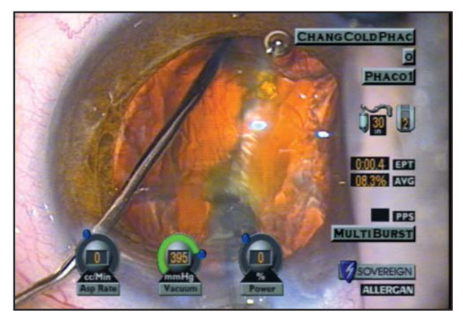
Fig. 3: Horizontal chopper hooks equator of a brunescent endonucleus. Phaco tip is impaled proximally with burst mode and high vacuum. The horizontal chopper tip maintains contact with the endonuclear surface as it moves peripherally beneath the capsulorhexis rim to the epinuclear space. The track made by this contact is visible.